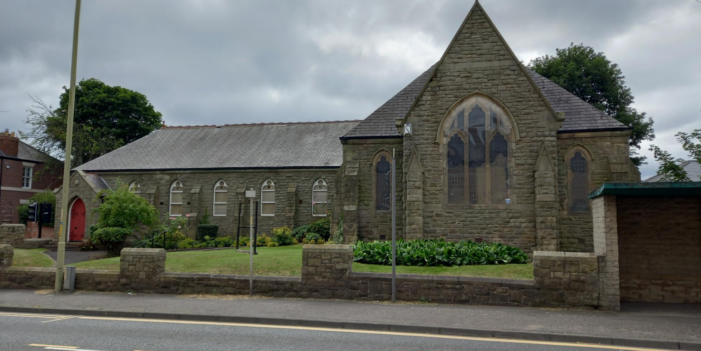
East Boldon Methodist Church, Front Street, East Boldon NE36 0PA