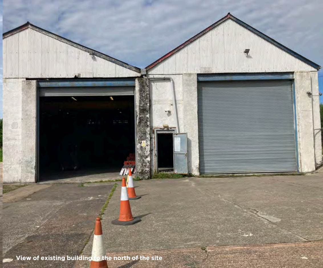
View of existing building to the north of the site