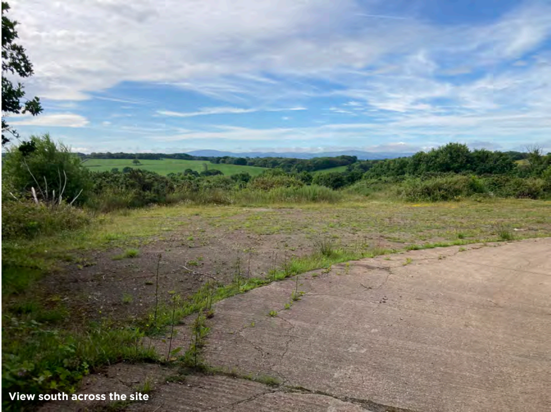
View south across the site