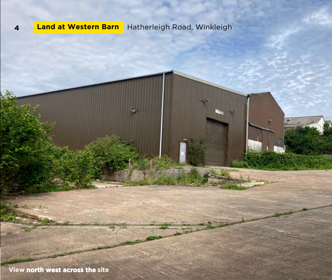
View north west across the site