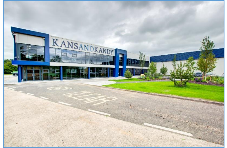
Car park and offices