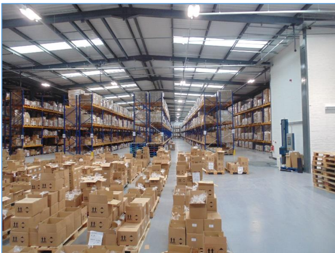
Inside adjoining Unit 2 warehouse