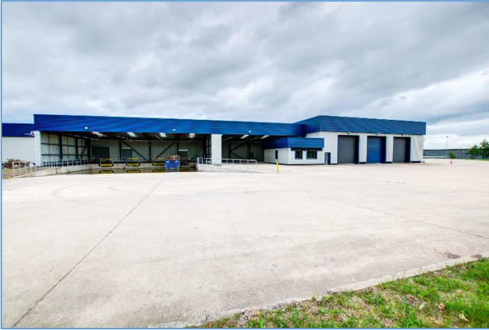
Level and dock level access from main service yard