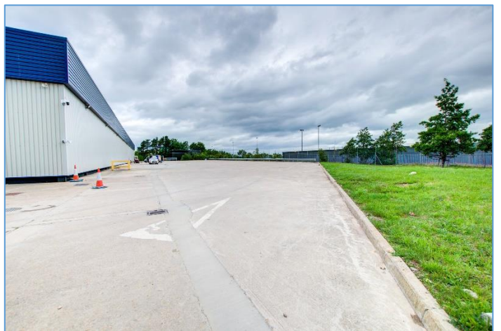
Additional service yard