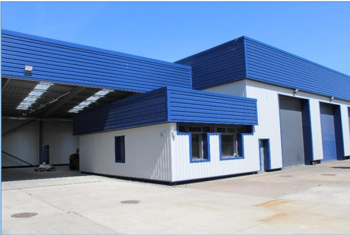
Transport Office and loading bay