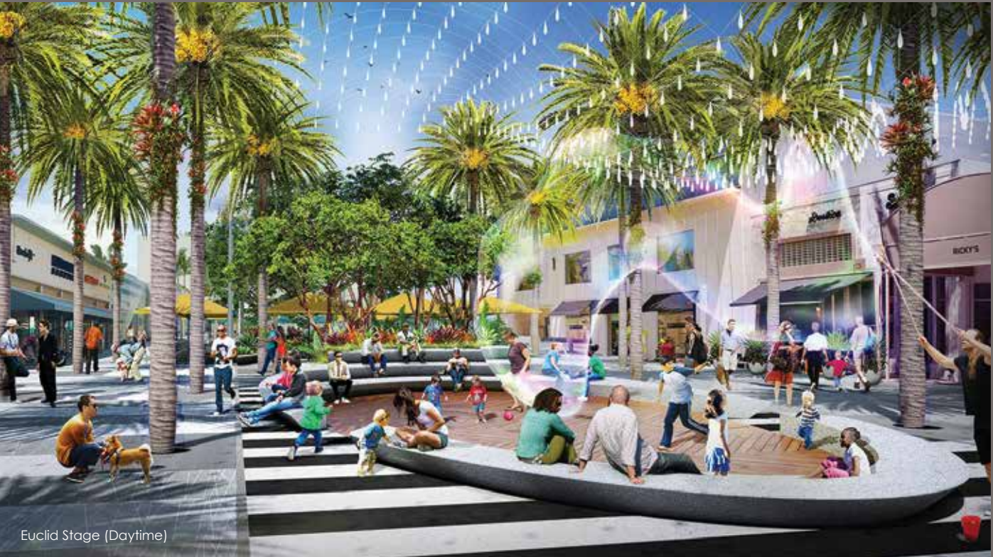
Euclid Stage (Daytime)