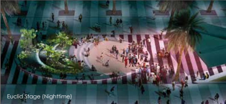
Euclid Stage (Nighttime)