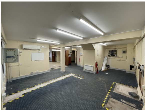
Ground Floor Sales

For details of all commercial properties marketed through this firm please visit: carterjonas.co.uk/commercial