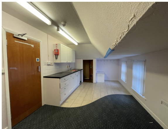
First Floor Staff Area