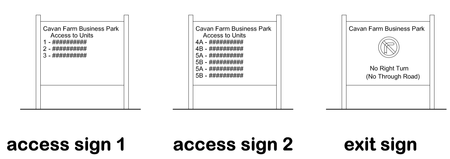
proposed signs at access points