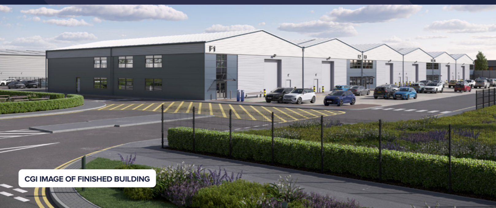
CGI IMAGE OF FINISHED BUILDING