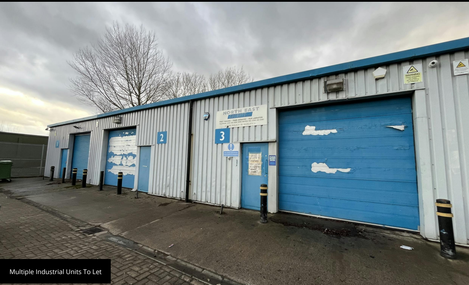
Multiple Industrial Units To Let