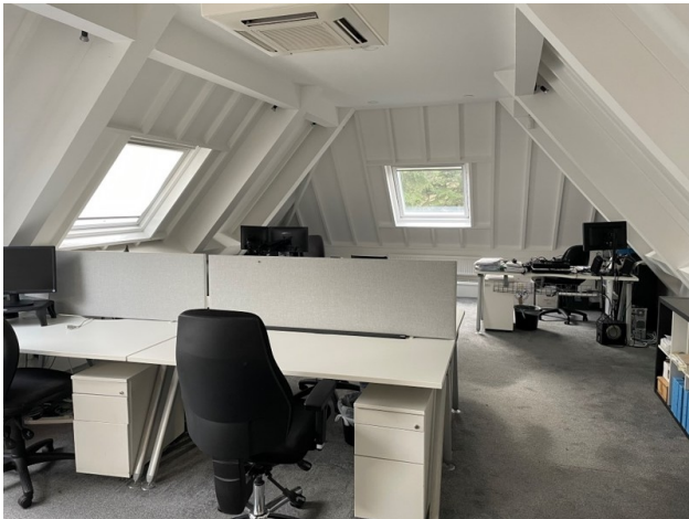
First Floor - Room 3