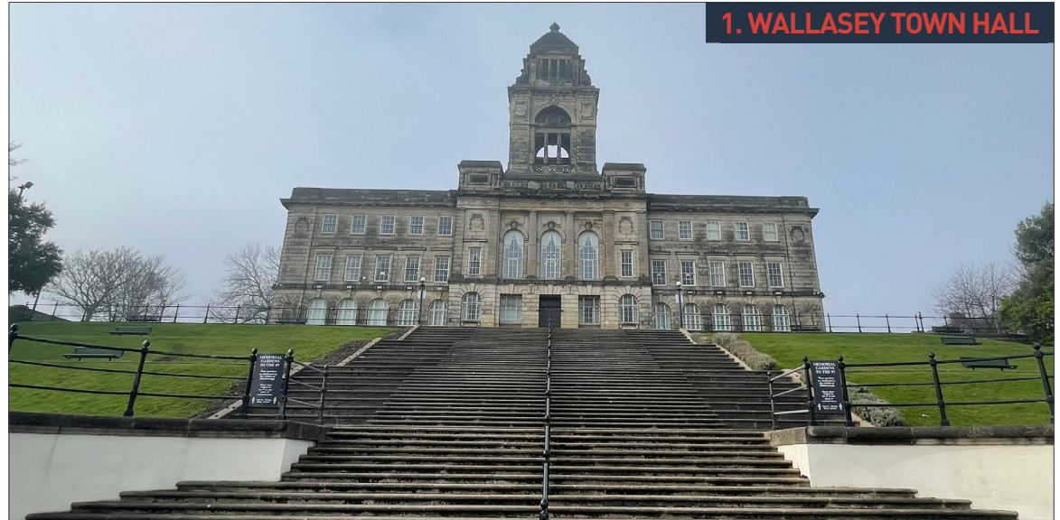
1. WALLASEY TOWN HALL