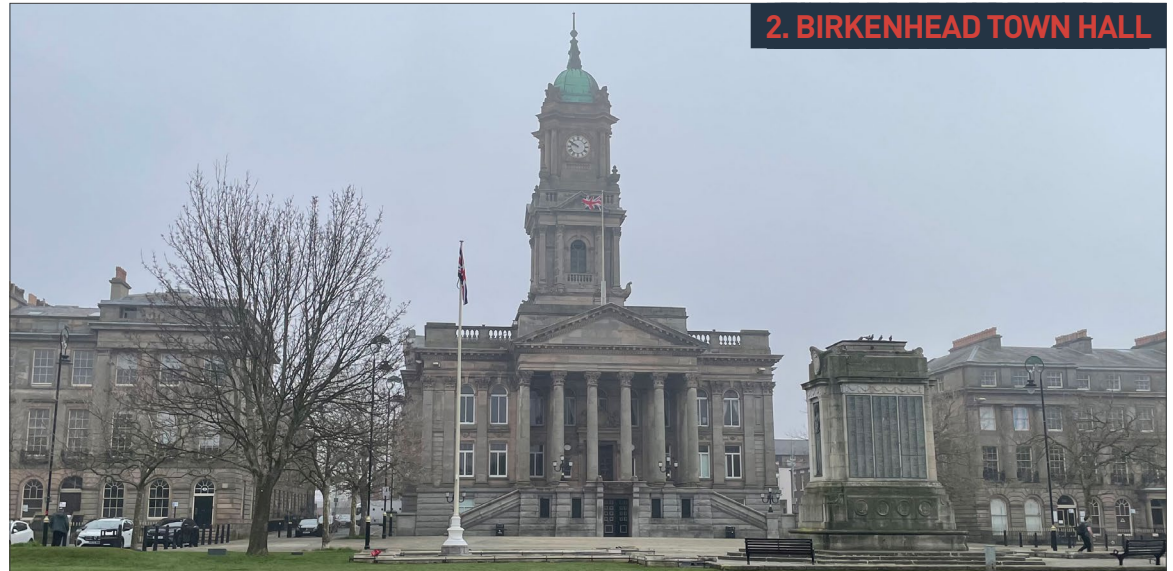
2. BIRKENHEAD TOWN HALL

WALLASEY TOWN HALL | BRIGHTON STREET | WALLASEY | WIRRAL | CH44 8ED | AND BIRKENHEAD TOWN HALL | MORTIMER STREET | BIRKENHEAD | WIRRAL | CH41 5EU |