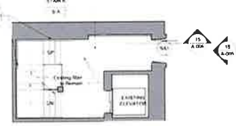
CONSTRUCTION PLAN - FIRST FLOOR STAIR A SCALE 3/8" = 1'-0"