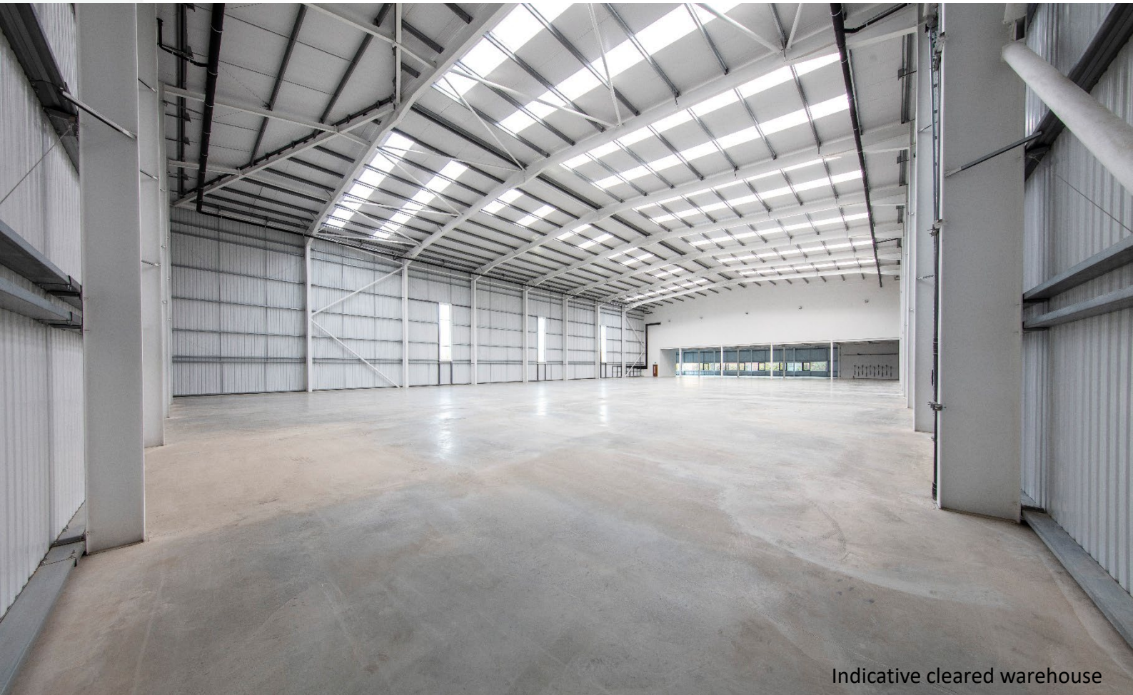
Indicative cleared warehouse