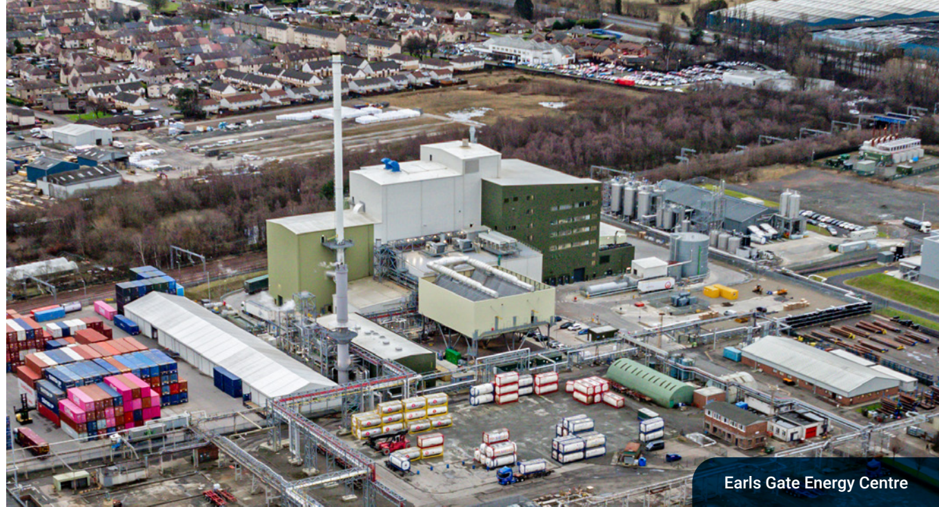
Earls Gate Energy Centre