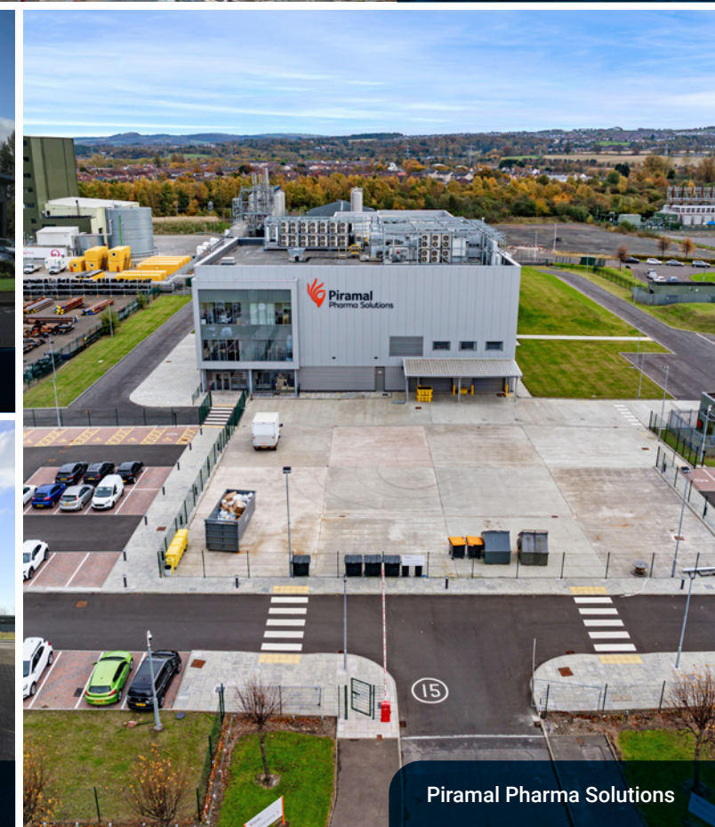
Piramal Pharma Solutions