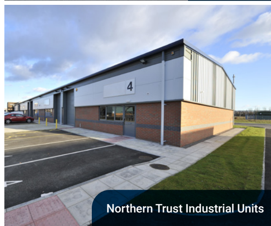
Northern Trust Industrial Units